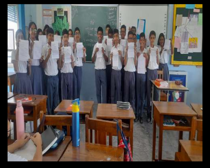
STUDENT'S PARTICIPATION IN ESSAY COPMPITITION